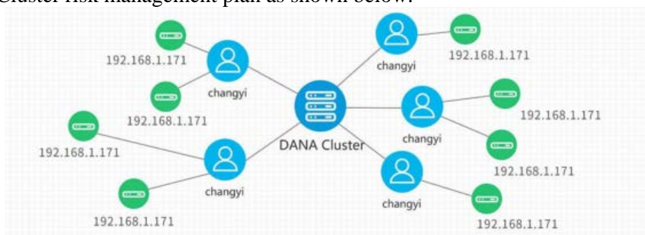
Fig.2 Cluster risk management plan

The demand for B2C e-commerce market fluctuates drastically. Products and technologies have a short life cycle. Product sales are affected by factors such as sales promotion, seasonal stimulation, and holidays, making it difficult to accurately predict demand, creating a lot of confusion in the supply chain; B2C e-commerce The supply chain is dominated by small and medium-sized enterprises, the core enterprises are lacking, and the strength and credit of core companies without high business reputation are the basis. The bank's supply chain financial services will increase costs and risks; and B2C e-commerce is mainly concerned with demand. The link between cost and efficiency, when cash flow is difficult, only considers innovative financing, and the pursuit of supply chain operational efficiency and capital utilization. For the relevant stakeholders in the supply chain, there are deviations in interest. Banks need to constantly optimize the members of the industry chain, choose B2C e-commerce companies with good business performance to provide innovative financing, and B2C e-commerce itself also needs to choose large-scale suppliers as their own upstream, and at the same time, they need to take into account The benefits and risks of funding [4]. Cluster risk management plan as shown below.